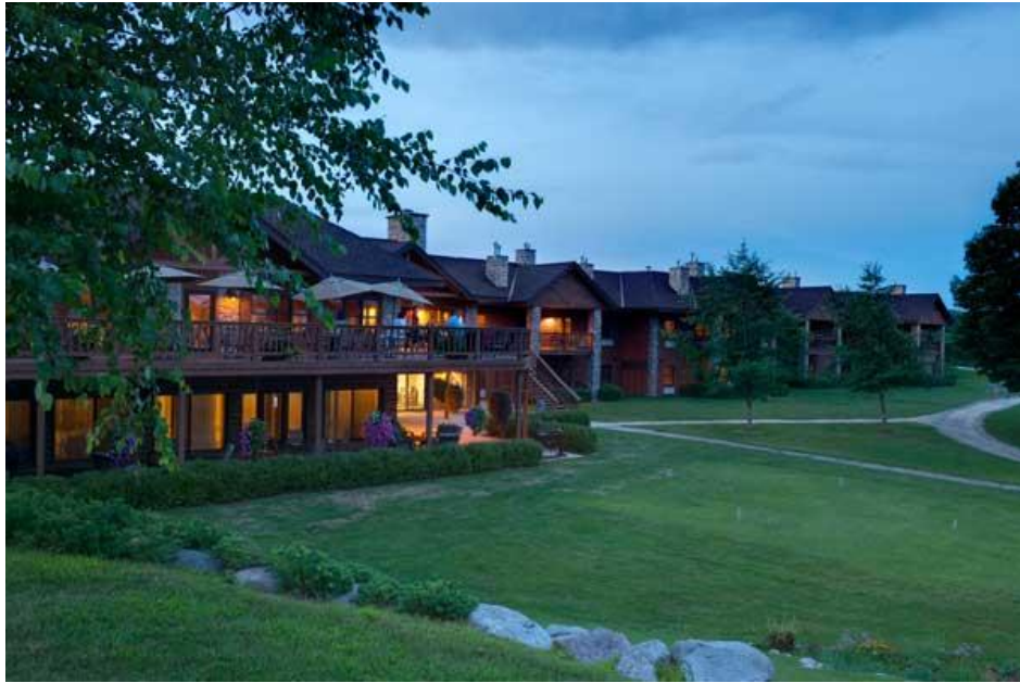
Sugar Lake Lodge 37584 Otis Lane Cohasset, Minnesota 55721